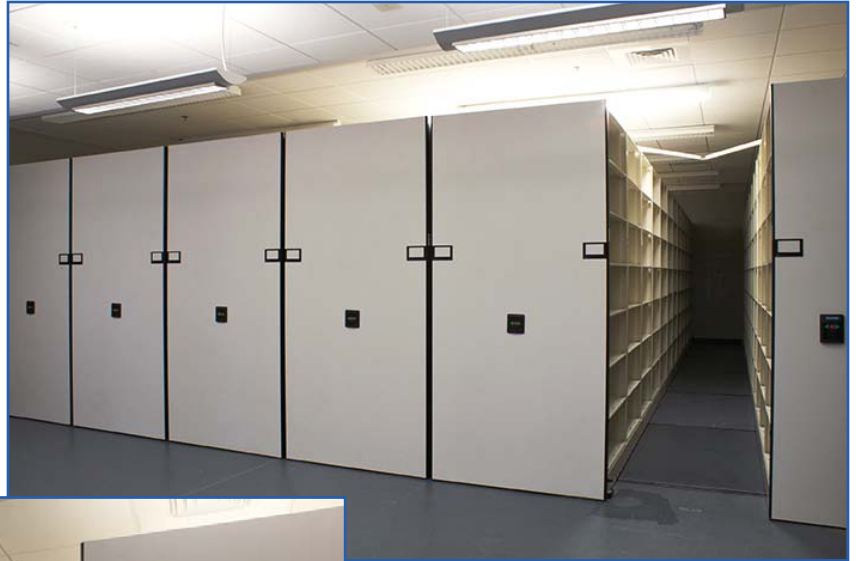
Automated High Density storage. →