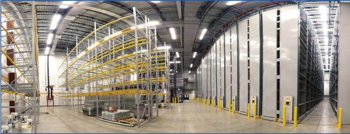
← Panoramic view of Bulk Storage pallet racks and 35' tall SpaceSaver Xtend moveable aisle shelves.