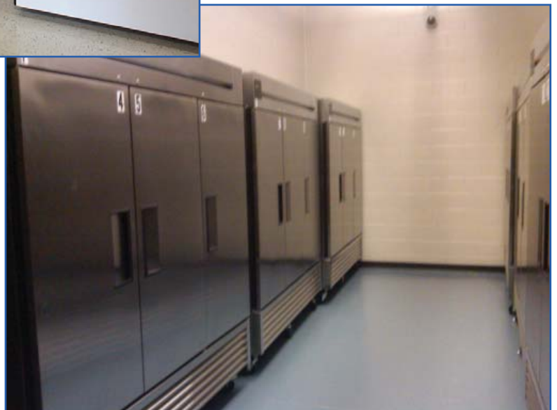
Refrigerated evidence storage. →