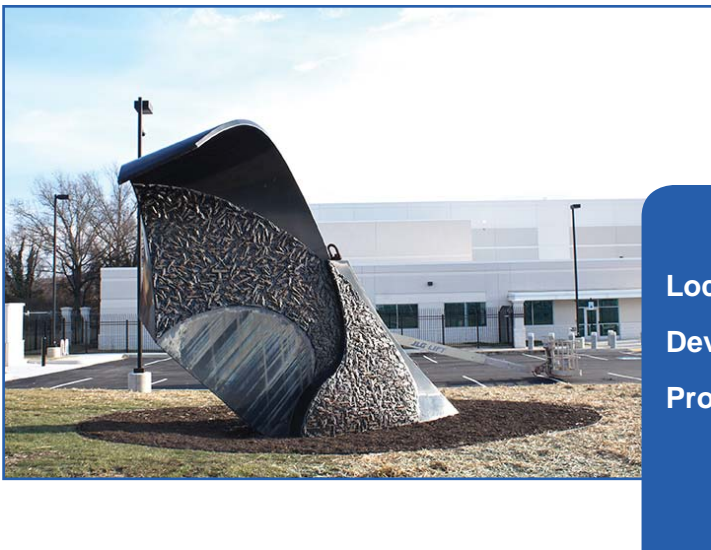
← “Guns to Plows” monument made of guns reclaimed during the DC buy-back program.