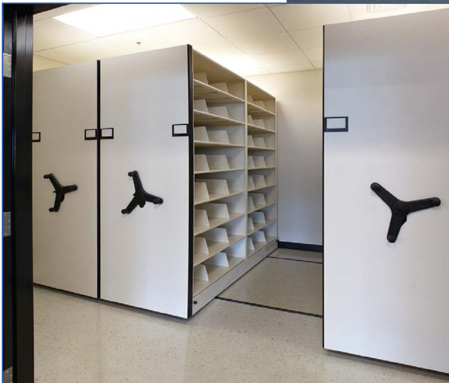
← High Density storage at Secure File room.